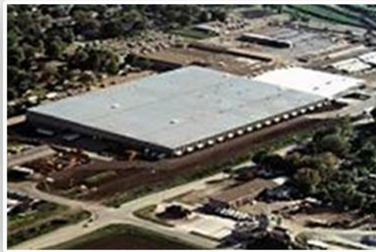
Marshalltown, Iowa USA