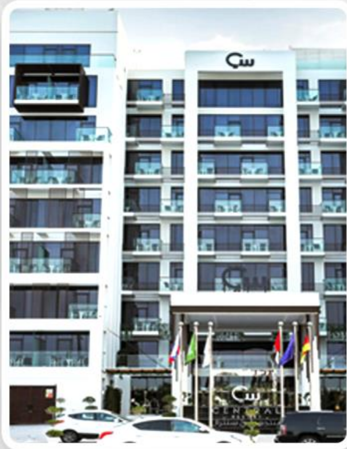
Plot PJCRC32C Palm Jumeirah Dubai