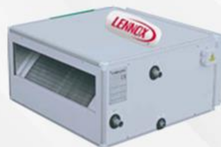
Medium Static ext. pr.