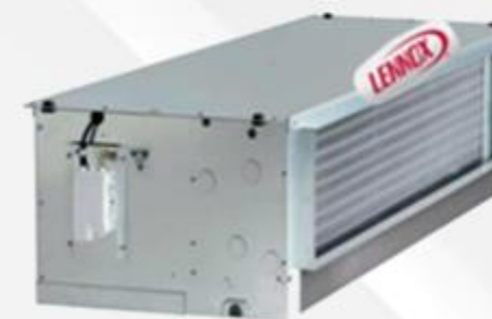
High Static ext. pr.