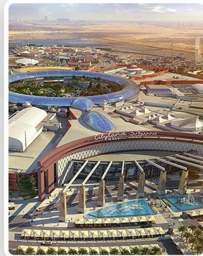
City Land Mall Dubai