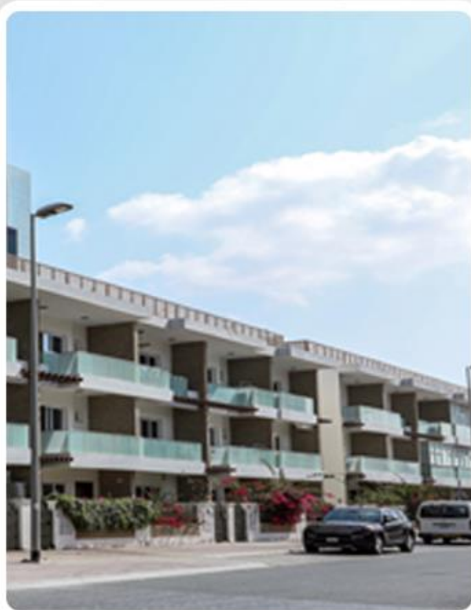
Residential Lots, JVC Dubai