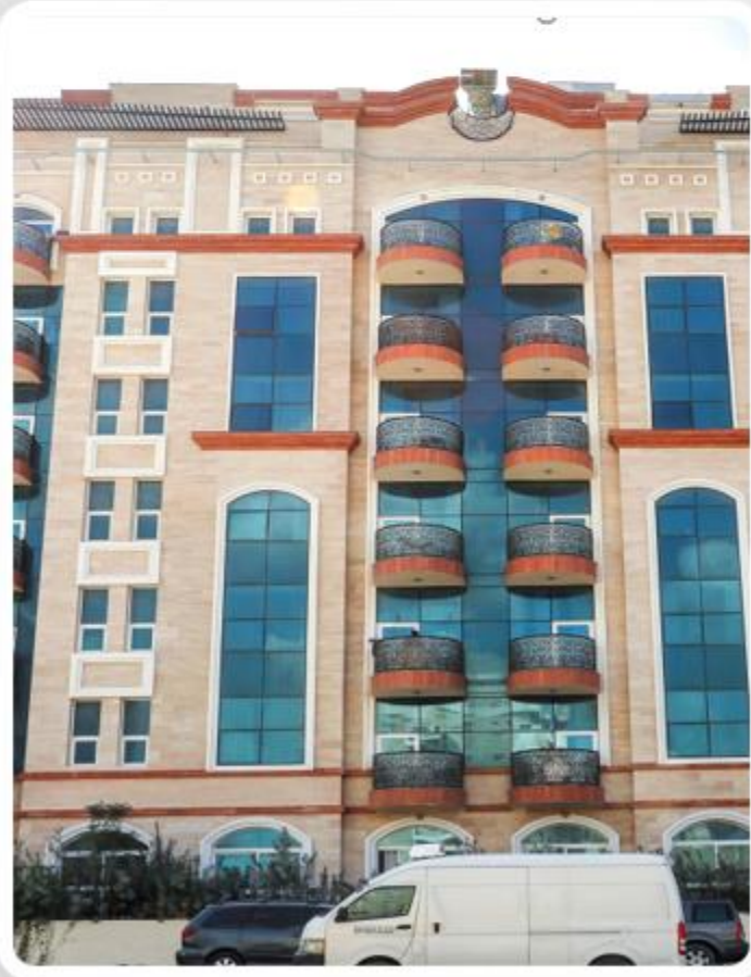
Building Plot IC3-B03, Intl. City Dubai