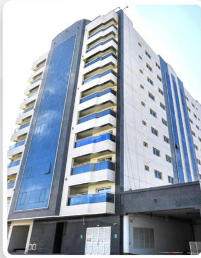
Plot 248-128, Al Qusais Ind Dubai