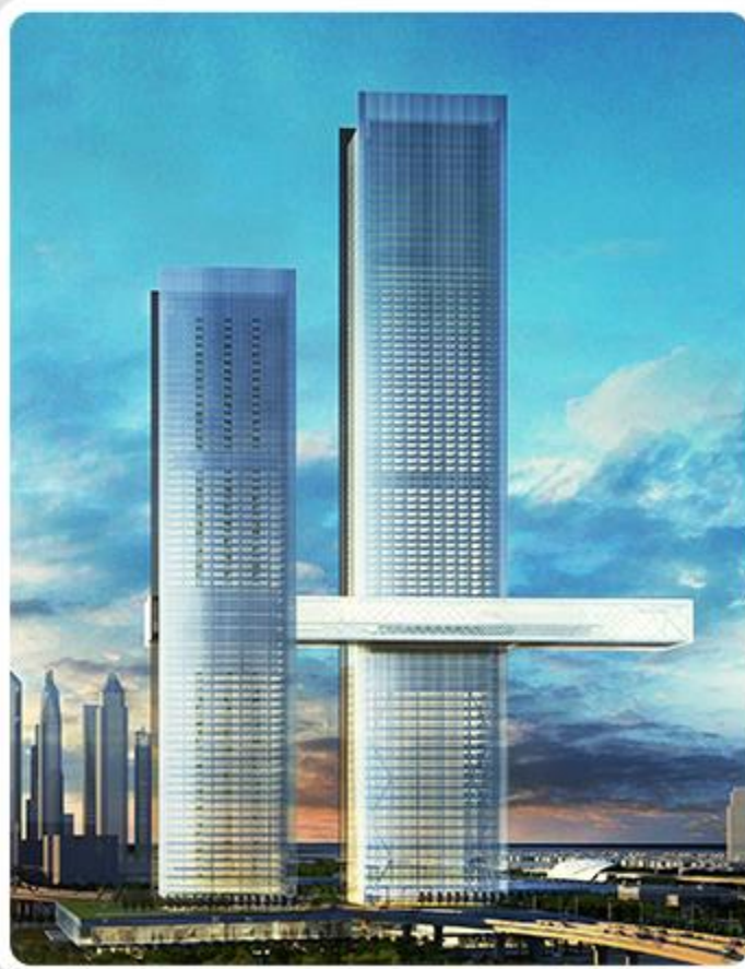
One Za'abeel Dubai