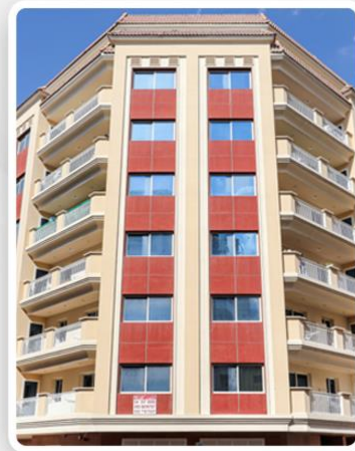
Plot 4210424 Al Warqa Dubai