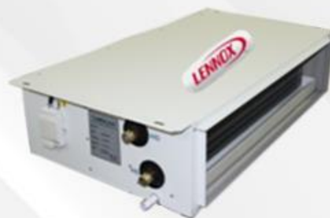
Low Static ext. pr.