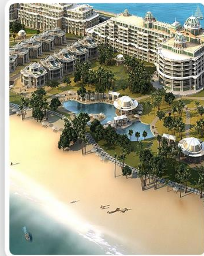
Kempinski Hotel & Residences Dubai