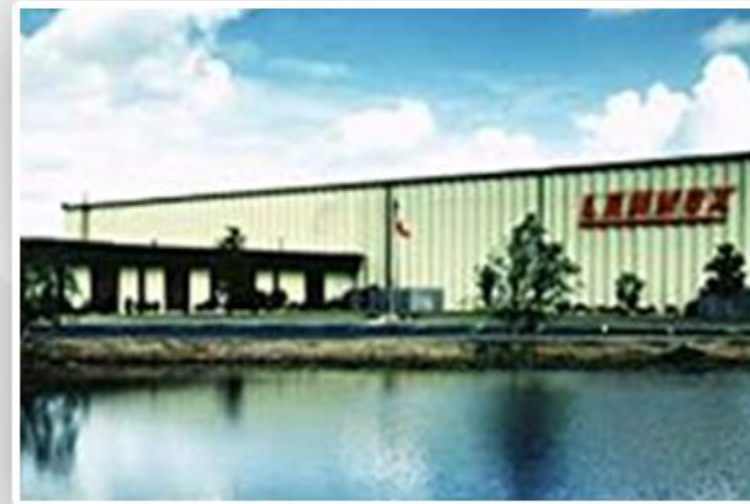
Stuttgart, Arkansas USA