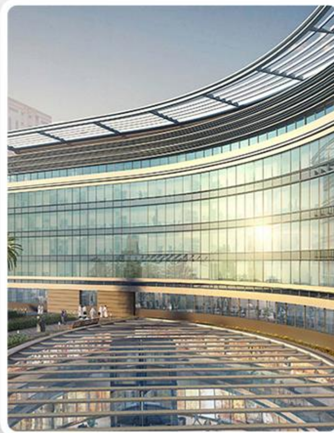
Sahara Centre Expansion Dubai