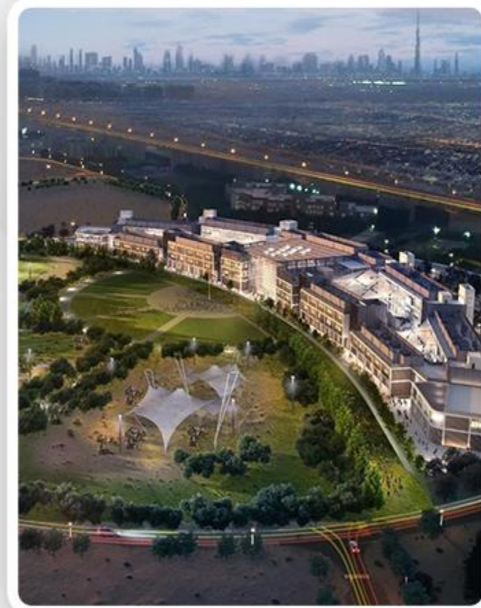
University Of Birmingham Dubai