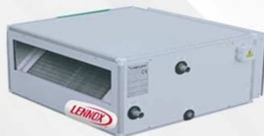
Fan Coil Units