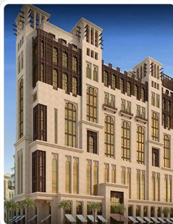
Hilton Garden Inn Dubai