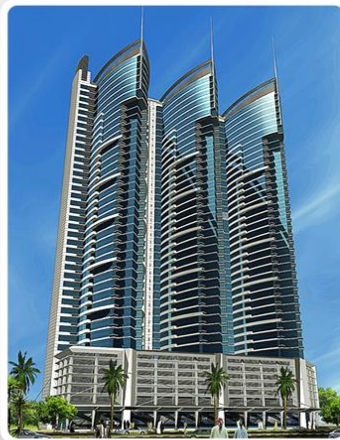
Novotel Al Barsha Dubai