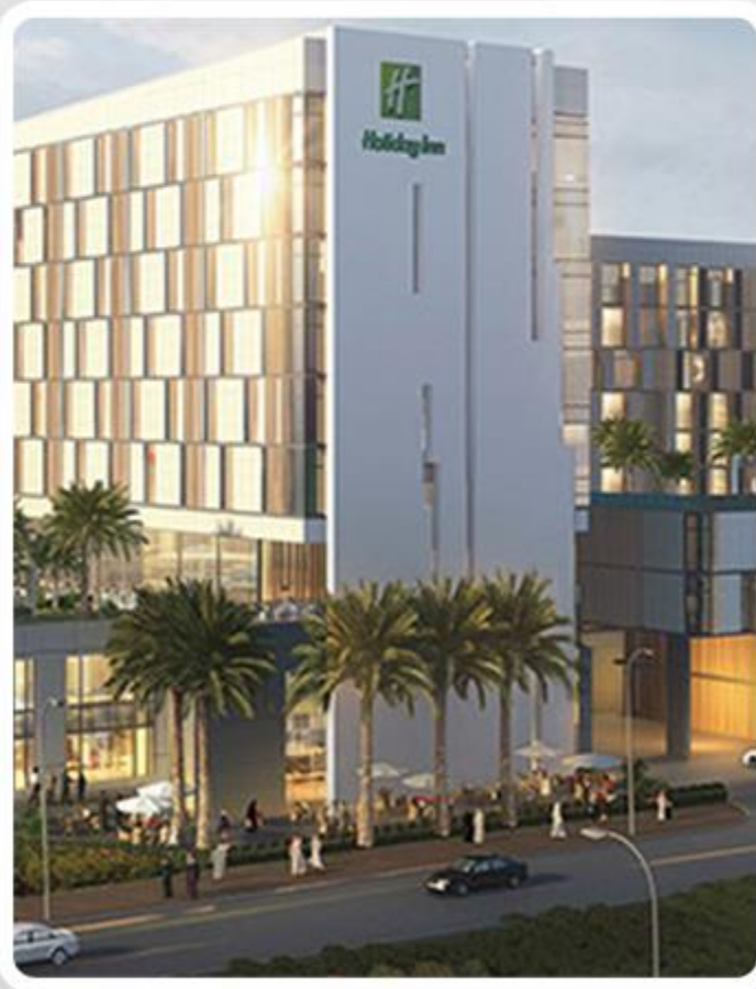
Holiday Inn Dubai