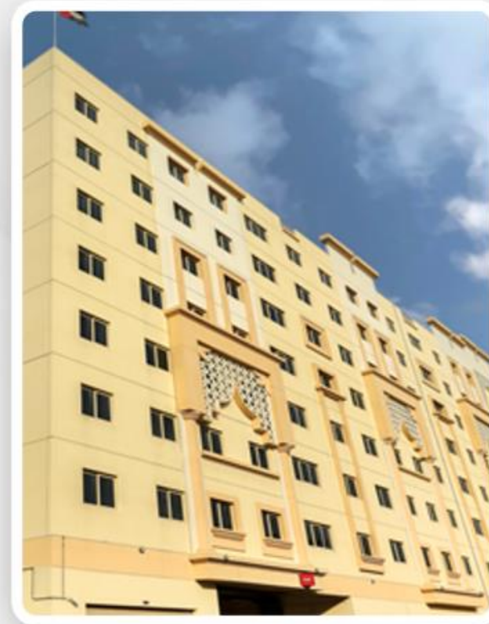
Labour Accommodation, Jabel Ali Dubai