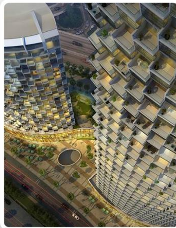
Burj Vista Dubai