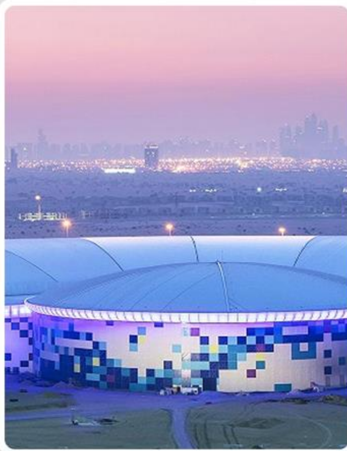
IMG Theme Park Dubai