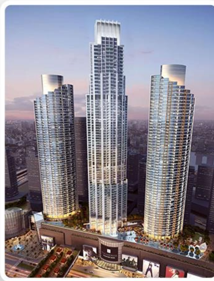
The Address Fountain Views Dubai