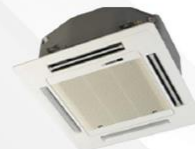
High Wall (Hydronic)