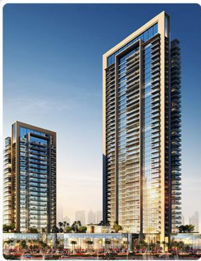
Boulevard Crescent Dubai