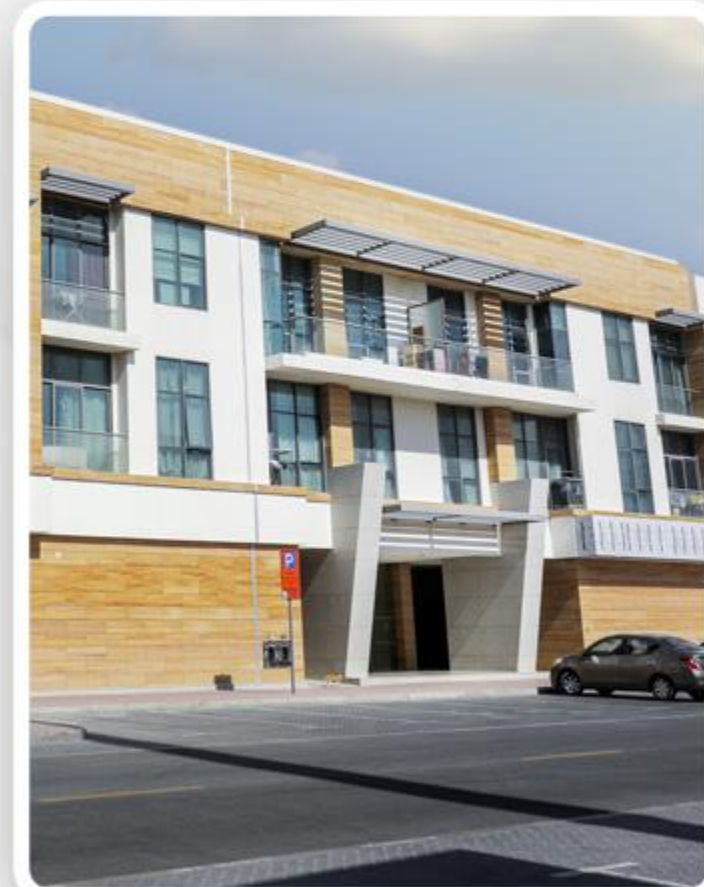
Al Fahd Contracting – Ras Al Khor Dubai