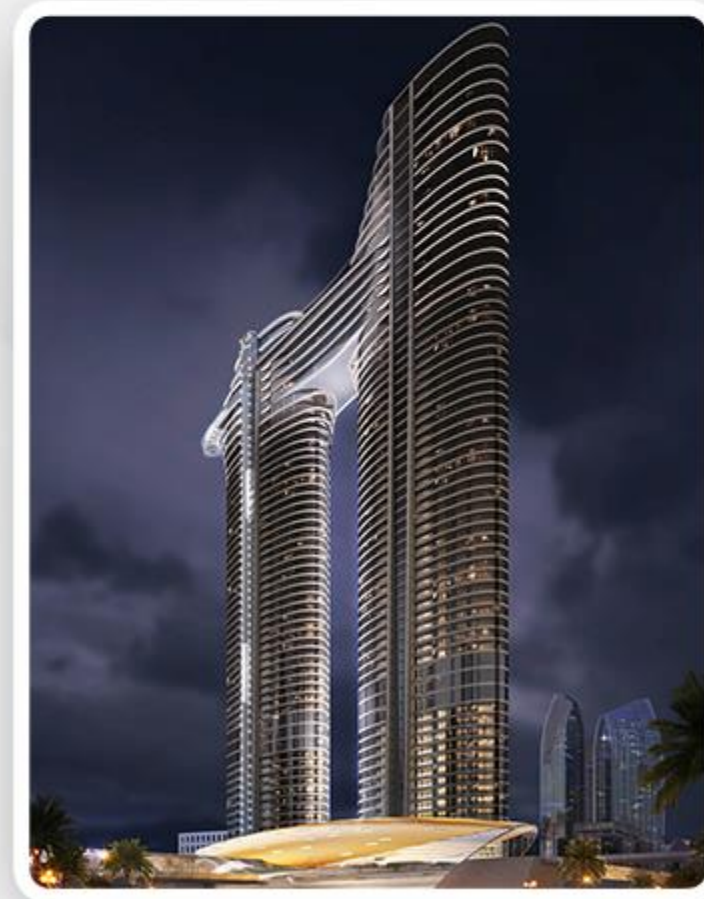
The Address Sky View Dubai